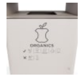
LARGE SIGNAGE ORGANICS IN DUNE