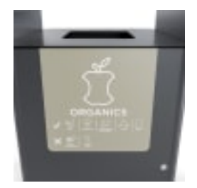
LARGE SIGNAGE ORGANICS IN MANGROVE