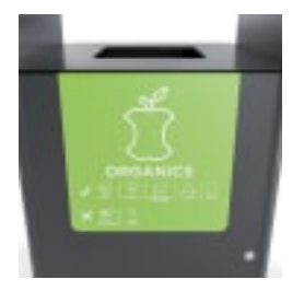
LARGE SIGNAGE ORGANICS IN LEAF