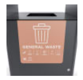
LARGE SIGNAGE GENERAL WASTE IN TERRITORY