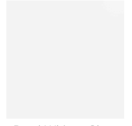
Pearl White - Gloss