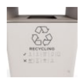
LARGE SIGNAGE RECYCLING IN DUNE