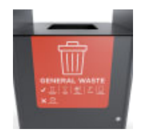
LARGE SIGNAGE GENERAL WASTE IN LOBSTER