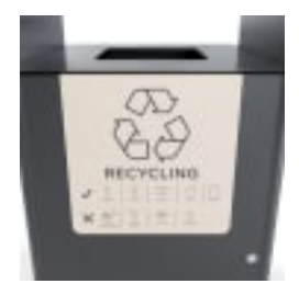
LARGE SIGNAGE RECYCLING IN PAPERBARK