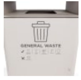
LARGE SIGNAGE GENERAL WASTE IN DUNE