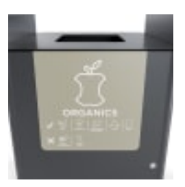
LARGE SIGNAGE ORGANICS IN MANGROVE