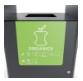
LARGE SIGNAGE ORGANICS IN LEAF