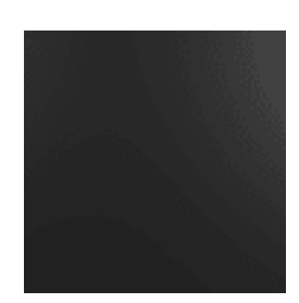
Matt Black - Matt