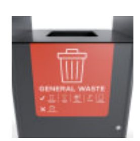
LARGE SIGNAGE GENERAL WASTE IN LOBSTER