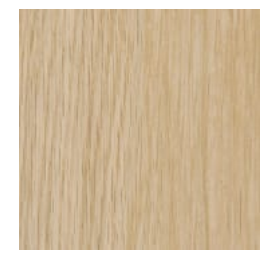
Laminex® Multipurpose Compact Laminate Calm Oak