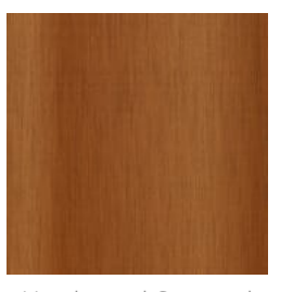
Hardwood Spotted Gum UV-Resistant Oil