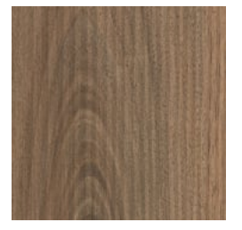
Laminex® Multipurpose Compact Laminate Natural Walnut