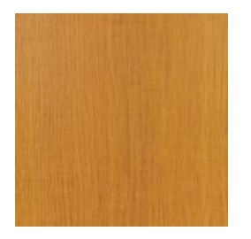
Hardwood Blackbutt UV-Resistant Oil