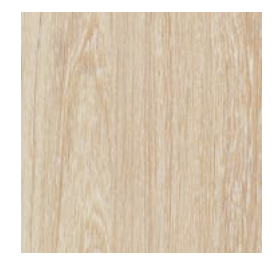
Laminex® Multipurpose Compact Laminate Seasoned Oak