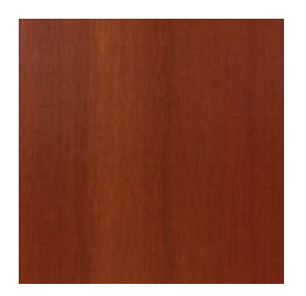
Hardwood Merbau UV-Resistant Oil