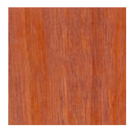
Hardwood Mixed Red UV-Resistant Pine Oil