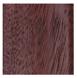
Hardwood Mixed Red UV-Resistant Mahogany Oil