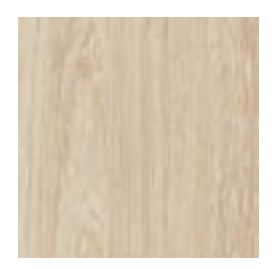
Laminex® Multipurpose Compact Laminate Seasoned Oak