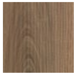
Laminex® Multipurpose Compact Laminate Natural Walnut