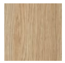
Laminex® Multipurpose Compact Laminate Classic Oak