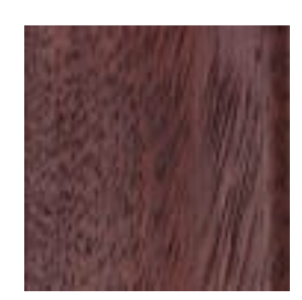
Hardwood Mixed Red UV-Resistant Mahogany Oil