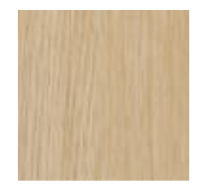
Laminex® Multipurpose Compact Laminate Calm Oak