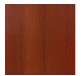
Hardwood Merbau UV-Resistant Oil