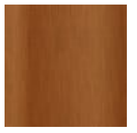
Hardwood Spotted Gum UV-Resistant