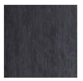
Hardwood Mixed Red UV-Resistant Ebony