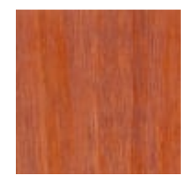
Hardwood Mixed Red UV-Resistant Pine Oil