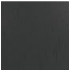
Duraslat™ XG Cave