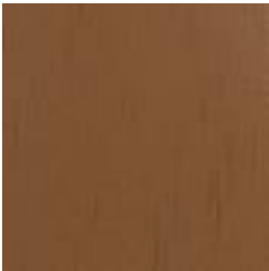
Duraslat™ XG Dune