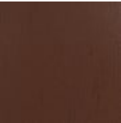
Duraslat™ XG Boulder