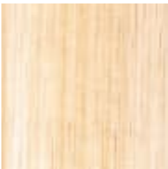
Hardwood Lacquered Victorian Ash