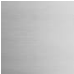
Stainless Steel Satin Finish