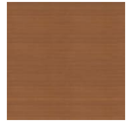
Hardwood Pigmented Impregnation