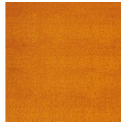
Hardwood Akoume Varnished