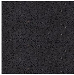
Precast Concrete Black Marble Brushed