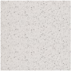
Precast Concrete White Granite Brushed