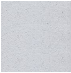
Precast Concrete White Marble Sandblasted