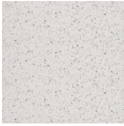
Precast Concrete White Granite Brushed