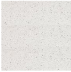
Precast Concrete White Granite Sandblasted