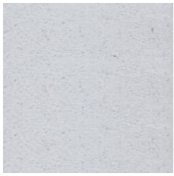
Precast Concrete White Marble Sandblasted