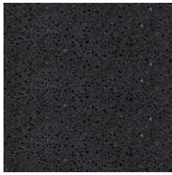
Precast Concrete Black Marble Brushed