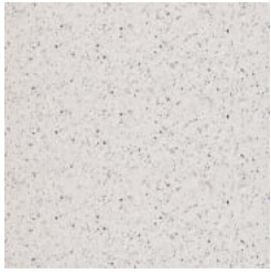
Precast Concrete White Granite Brushed