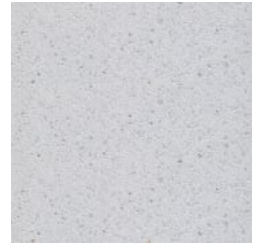
Precast Concrete White Marble Brushed