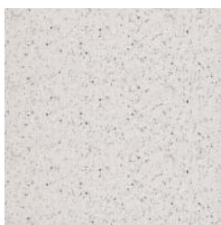
Precast Concrete White Granite Brushed