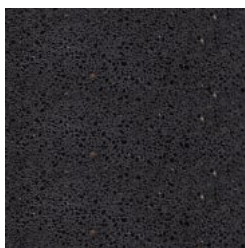
Precast Concrete Black Marble Brushed