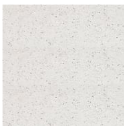
Precast Concrete White Granite Sandblasted