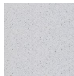
Precast Concrete White Marble Brushed