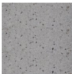
Precast Concrete Grey Granite Brushed