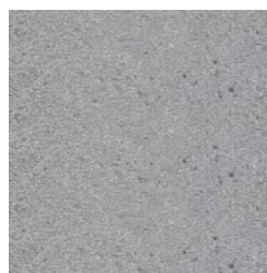
Precast Concrete Grey Granite Sandblasted