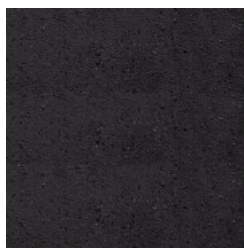
Precast Concrete Black Marble Sandblasted