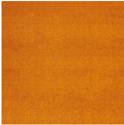
Hardwood Akoume Varnished