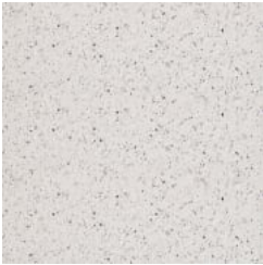
Precast Concrete White Granite Brushed