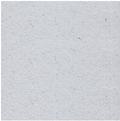
Precast Concrete White Marble Sandblasted