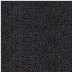
Precast Concrete Black Marble Brushed