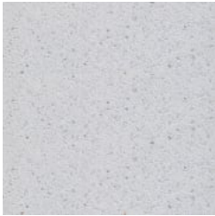
Precast Concrete White Marble Brushed