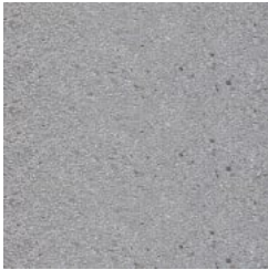
Precast Concrete Grey Granite Sandblasted