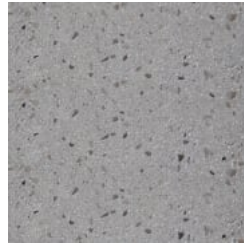
Precast Concrete Grey Granite Brushed