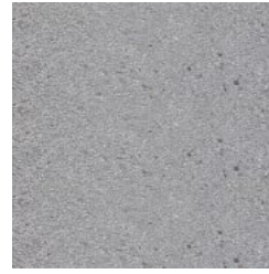
Precast Concrete Grey Granite Sandblasted