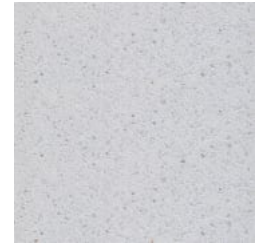
Precast Concrete White Marble Brushed