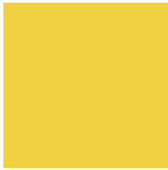
Bold Powder-Coat Moonlight Satin