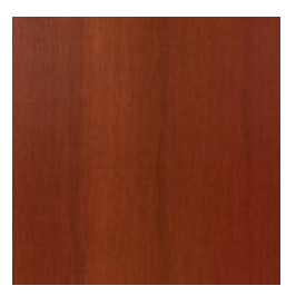
Hardwood Merbau UV-Resistant Oil