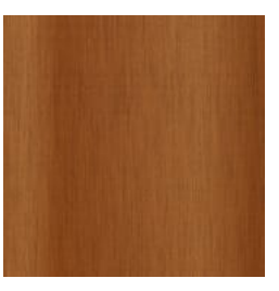
Hardwood Spotted Gum UV-Resistant Oil