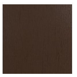
Duraslat™ XG Alcove