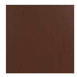
Duraslat™ XG Boulder