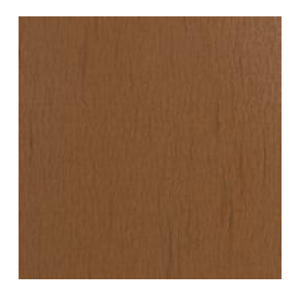
Duraslat™ XG Dune