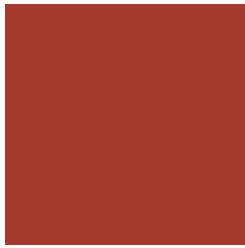
Bold Powder-Coat Lobster Satin