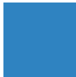
Bold Powder-Coat Bondi Blue Gloss