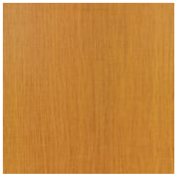
Hardwood Blackbutt UV-Resistant Oil