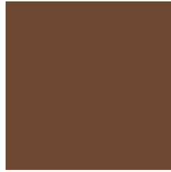
Solid Powder-Coat Coffee Satin